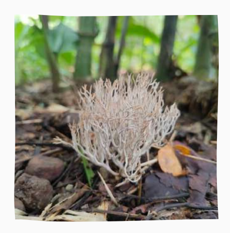
Ramaria stricta Location: Sanjay Gandhi National Park By: Vedant Khokrale (SYBsc) SIES College, Sion