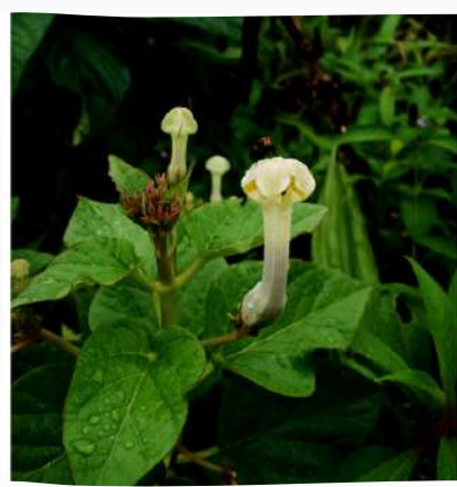
Ceropegia sahyadrica Location: Khandala