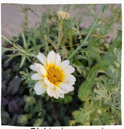
Glebionis coronaria Location: Dharmashala