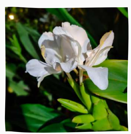
Opuntia humifusa Location: Amboli hills By: Sanket Khambe (SYBsc) SIES College, Sion