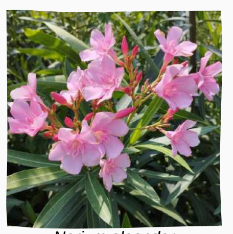
Nerium oleander Location: BARC By: Somlata Nagar (SYBsc) SIES College, Sion