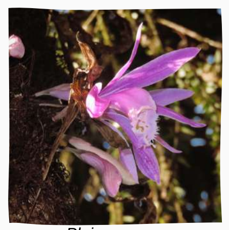
Pleione praecox Location: Jawarharlal Nehru Botanical Garden, Sikkin